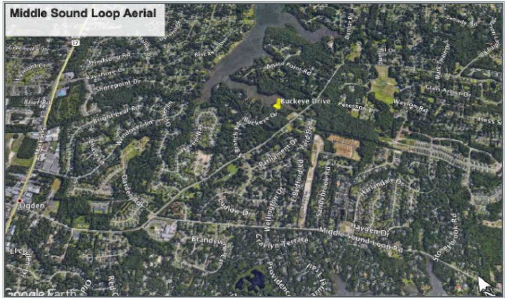
Middle Sound Loop Aerial